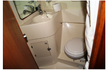
Moody 37 Centre Cockpit - Day Heads