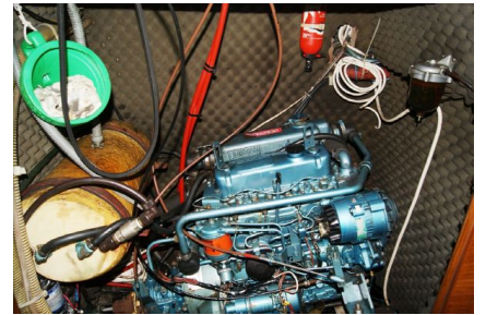
Moody 37 Centre Cockpit - Engine