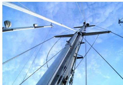
Moody 37 Centre Cockpit - Mast