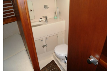
Moody 37 Centre Cockpit - Ensuite