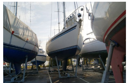
Moody 37 Centre Cockpit