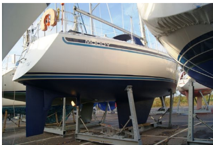
Moody 37 Centre Cockpit - Ashore