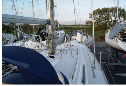
Moody 37 Centre Cockpit - Side Deck