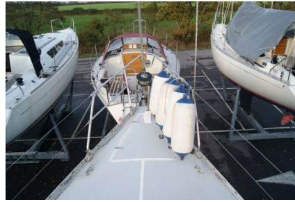
Moody 37 Centre Cockpit - Foredeck