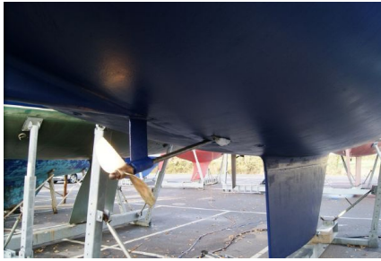
Moody 37 Centre Cockpit - Propeller