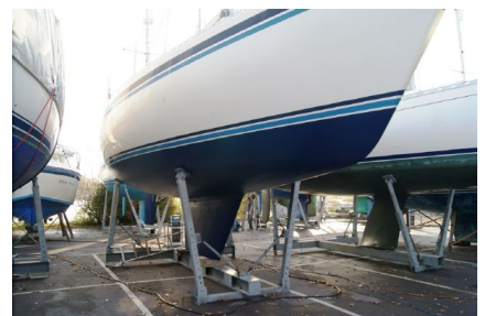
Moody 37 Centre Cockpit - Hull Profile