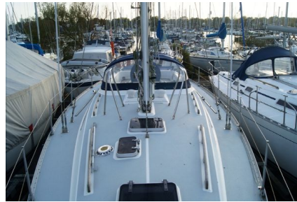
Moody 37 Centre Cockpit - Deck