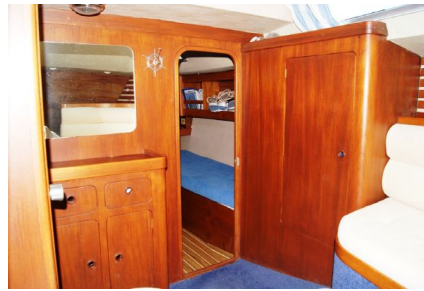
Moody 37 Centre Cockpit - Aft Cabin