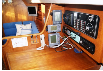
Moody 37 Centre Cockpit - Chart Table