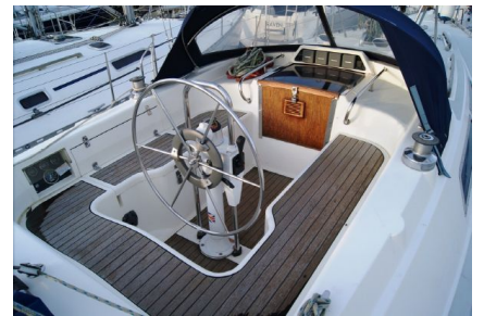
Moody 37 Centre Cockpit - Helm