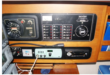
Moody 37 Centre Cockpit - Electrics