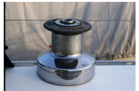
Moody 37 Centre Cockpit - Winch