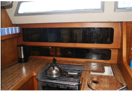
Moody 37 Centre Cockpit - Galley