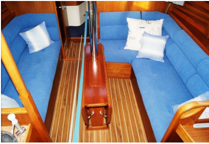
Moody 37 Centre Cockpit - Saloon