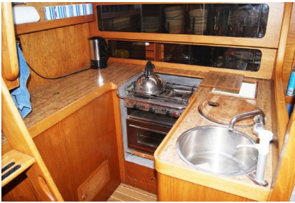
Moody 37 Centre Cockpit - Galley