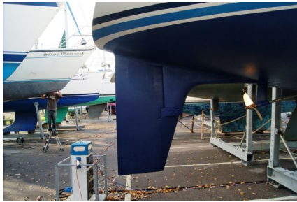
Moody 37 Centre Cockpit - Rudder