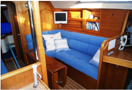
Moody 37 Centre Cockpit - Saloon Stb