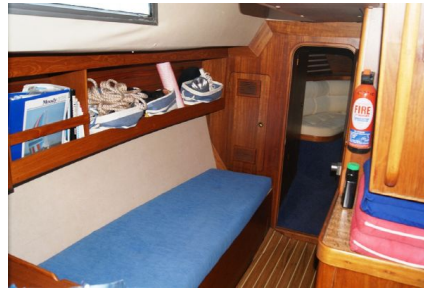
Moody 37 Centre Cockpit - Pilot Berth