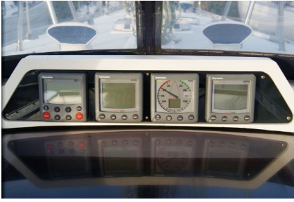
Moody 37 Centre Cockpit - Instruments