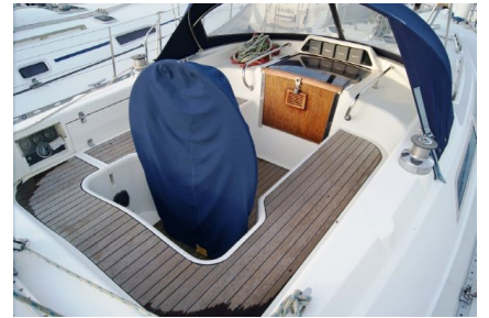
Moody 37 Centre Cockpit - Helm Cover