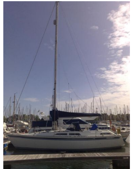
Moody 37 Centre Cockpit - Overall

Opal Marine Ltd. does not arrange demonstrations or accept any responsibility for demonstrations or viewings, whether accompanied or unaccompanied.