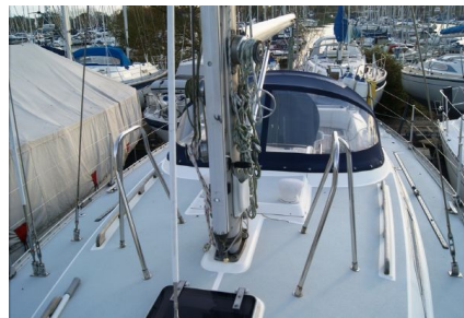
Moody 37 Centre Cockpit - Pit