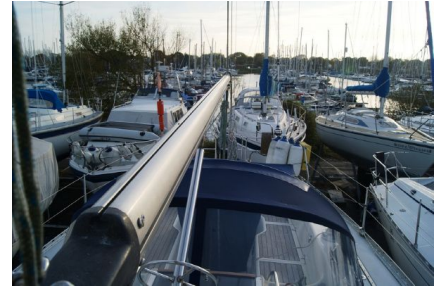
Moody 37 Centre Cockpit - Boom