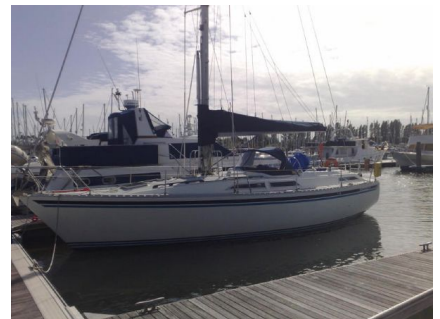
Moody 37 Centre Cockpit - Port Side