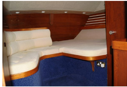
Moody 37 Centre Cockpit - Aft Cabin