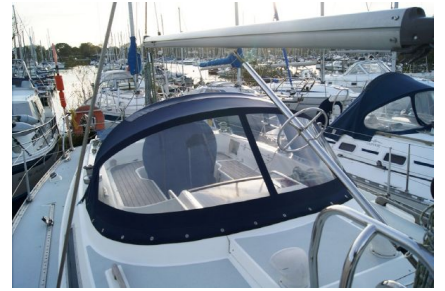
Moody 37 Centre Cockpit - Sprayhood