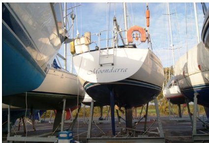
Moody 37 Centre Cockpit - Transom