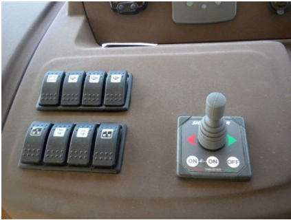
Azimut 43 - Controls