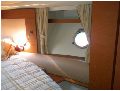
Azimut 43 - Owner's Cabin Starboard