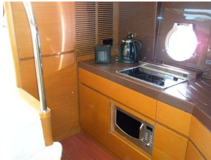
Azimut 43 - Galley