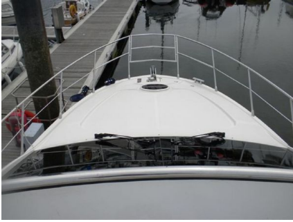
Azimut 43 - Foredeck