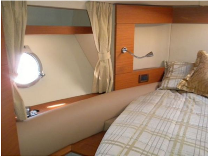
Azimut 43 - Owner's Cabin Port