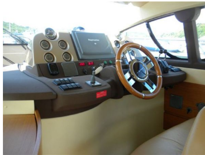
Azimut 43 - Helm Position