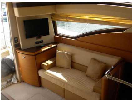
Azimut 43 - Lower Saloon Seating