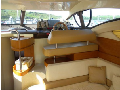
Azimut 43 - Upper Saloon