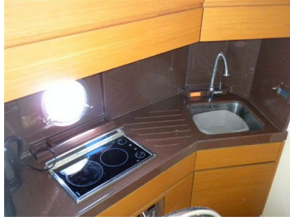
Azimut 43 - Hob and Sink