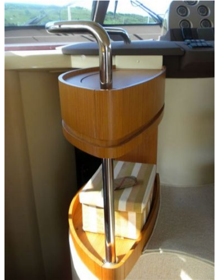
Azimut 43 - Helm Steps