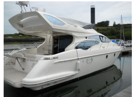
Azimut 43 - Stern