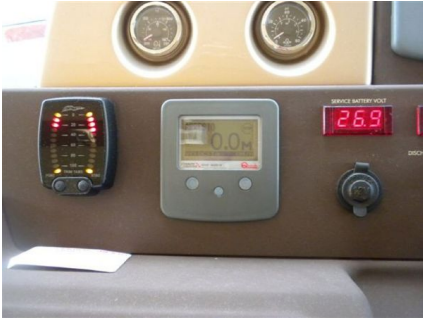
Azimut 43 - Instruments