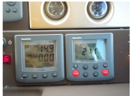
Azimut 43 - Instruments