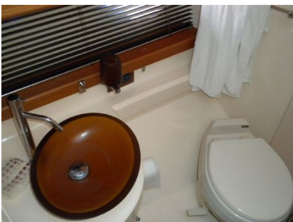
Azimut 43 - Owner's Cabin Ensuite