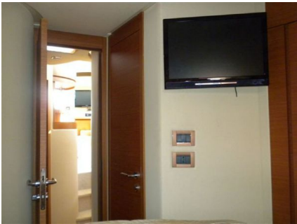
Azimut 43 - TV