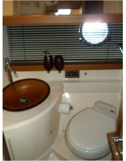
Azimut 43 - Guest Ensuite