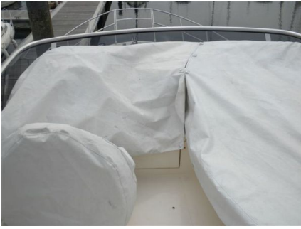
Azimut 43 - Flybridge Sun Cashions