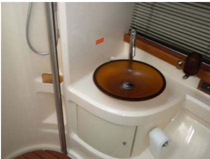
Azimut 43 - Owner's cabin Ensuite Shower