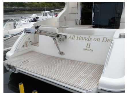
Azimut 43 - Bathing Platform