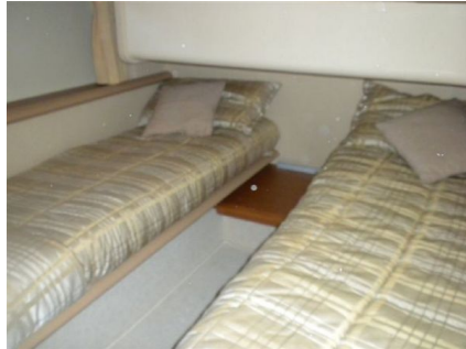
Azimut 43 - Twin Guest Berth