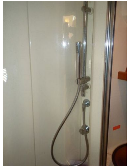
Azimut 43 - Shower