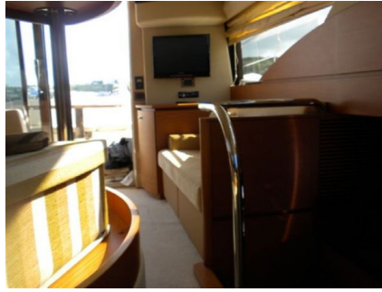
Azimut 43 - Companionway