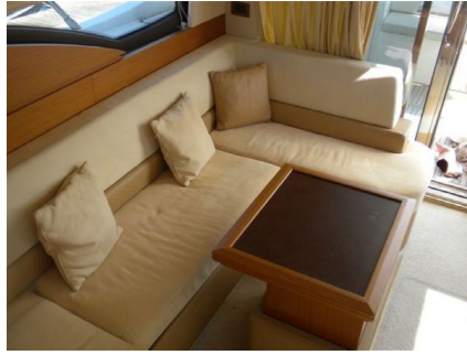
Azimut 43 - Saloon Table