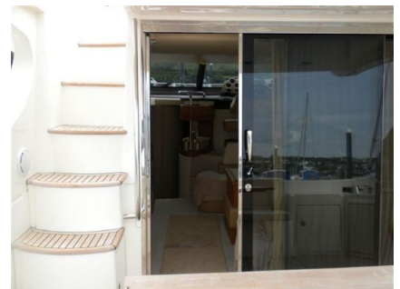
Azimut 43 - Sliding Doors to Saloon