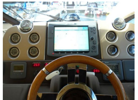
Azimut 43 - Helm