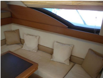
Azimut 43 - Upper Saloon Seating