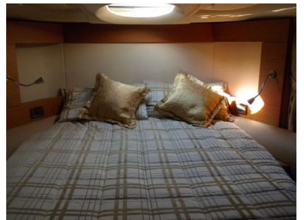
Azimut 43 - Owner's Double Berth