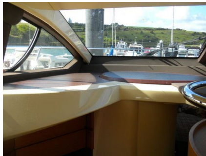
Azimut 43 - Windscreen