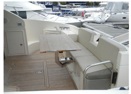
Azimut 43 - Cockpit Seating