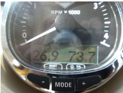
Azimut 43 - Display