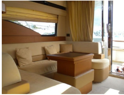
Azimut 43 - Saloon Looking Aft