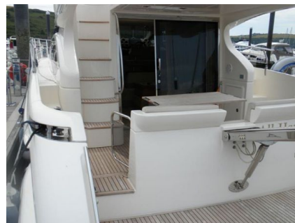
Azimut 43 - Cockpit

Opal Marine Ltd. does not arrange demonstrations or accept any responsibility for demonstrations or viewings, whether accompanied or unaccompanied.