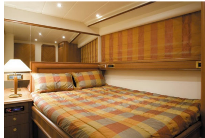
Double Guest Cabin