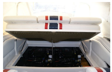
Hydraulic Engine Access