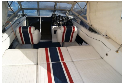
Cockpit and sunpad

demonstrations or viewings, whether accompanied or unaccompanied.