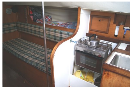
Saloon Starboard Side