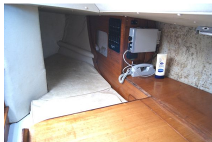
Quarterberth and Chart Area