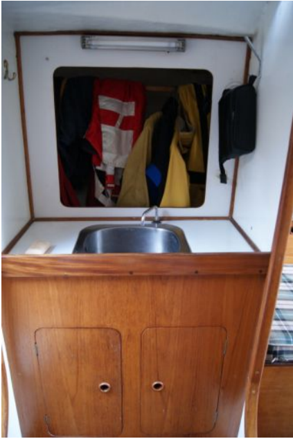
Sink and Wet Locker