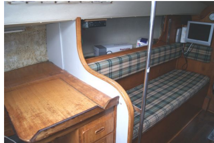
Saloon Port Side