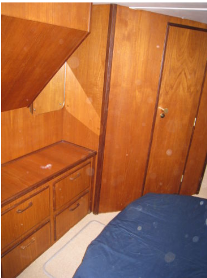
Aft Cabin Storage