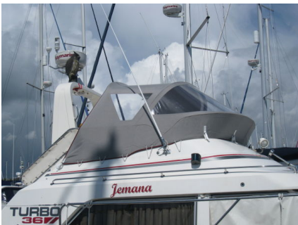
New Sprayhood (Apr 2009)