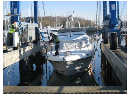
Relaunch March 09