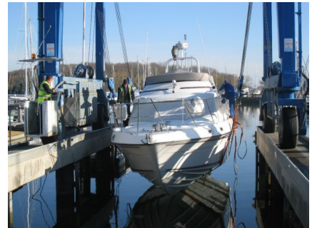
Relaunch March 09