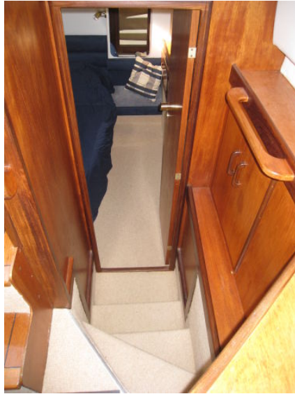
Steps to Aft Cabin