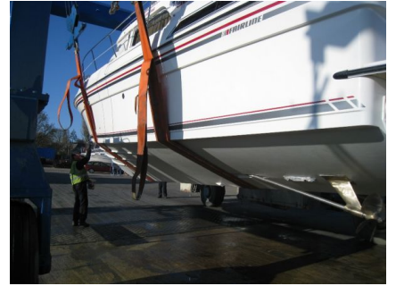
Relaunch March 09