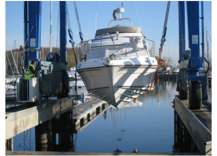
Relaunch March 09