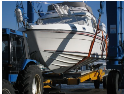
Relaunch March 09