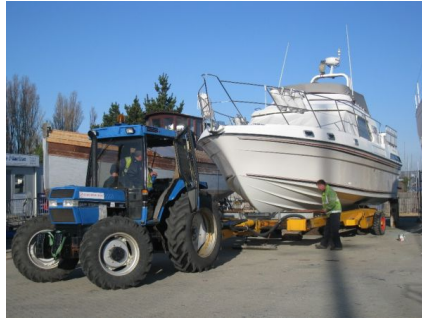
Relaunch March 09