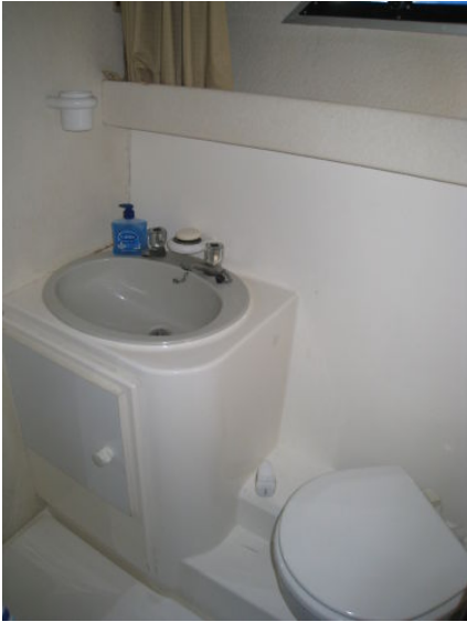
Aft Cabin Ensuite