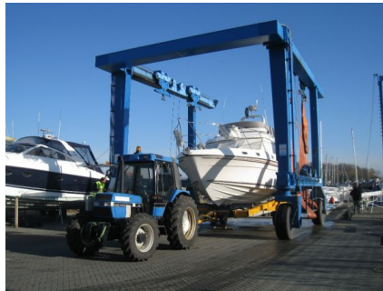
Relaunch March 09