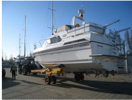
Relaunch March 09